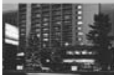
Central Downtown Location